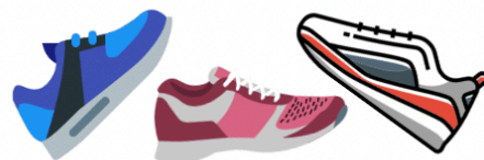
PE Trainers or plimsolls

Footwear does not need to be in the school colours and should be PE trainers that fit comfortably.